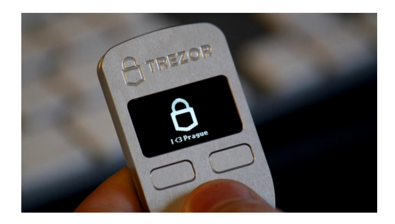
Fig. 3. Example of a photograph of acceptable quality and resolution.

Photographs are defined to include both real and computer generated images, and should be displayed as small as possible without affecting readability. Images must be of high quality and of sufficient resolution (300 DPI JPEGs are preferred).