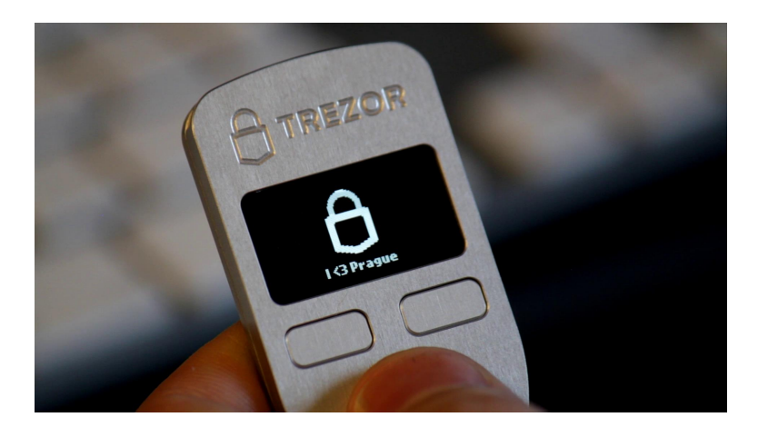
Fig. 3. Example of a photograph of acceptable quality and resolution.

Photographs are defined to include both real and computer generated images, and should be displayed as small as possible without affecting readability. Images must be of high quality and of sufficient resolution (300 DPI JPEGs are preferred).